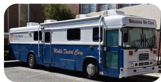
Florida Baptist Convention Mobile Dental Bus

If you are interested in serving with Suwannee Baptist Association in a joint Mobile Dental Mission Project in September 2021, there will be a planning meeting Tuesday, January 26, 2021 at Wellborn Baptist Church at 6:00 PM.